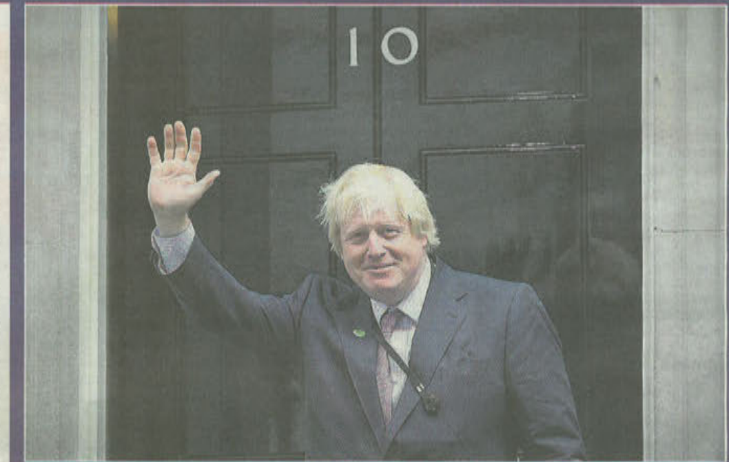
TOP JOB: Mr Johnson is more of a mainstream Conservative than a rabble-rousing populist

It's often forgotten that when he compared women who wear the burqa to letterboxes, he was