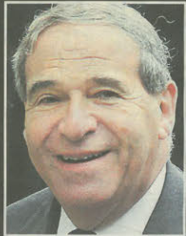
Lord Brittan was investigated