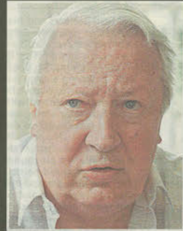
Sir Edward Heath was named