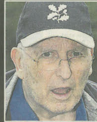
Lord Janner faced accusations